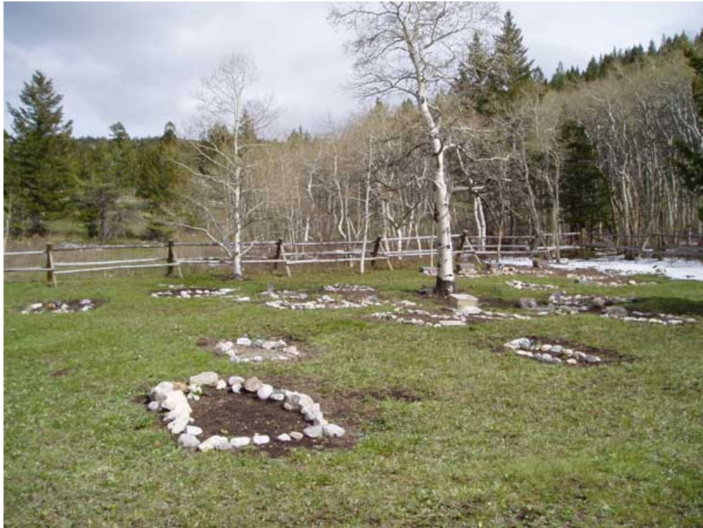
Cemetery maintained by Al and Elaine Wiseman of Choteau

The Wisemans were also involved in the development of the Choteau Museum and nearby Michif house furnished in Métis traditional style. Métis Elder Al Wiseman is also an archivist of Michif fiddle tunes.